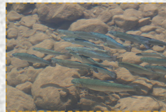
Rainbow Trout in East Verde river after the stocking.