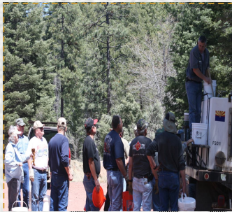
Waiting to receive a bucket of fish

Tuesday, April 8th , fourteen Payson Fly casters, Trout Unlimited chapter members and guests stocked over 770 rainbow trout along the East Verde River. The bucket brigade and people working in pairs made this effort a huge success and many nice size rainbow trout were distributed along the streams of the East Verde.