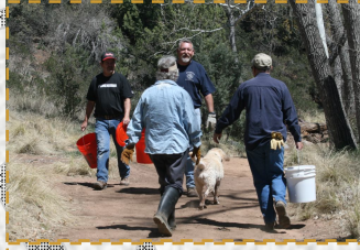
Bucket distribution of fish.